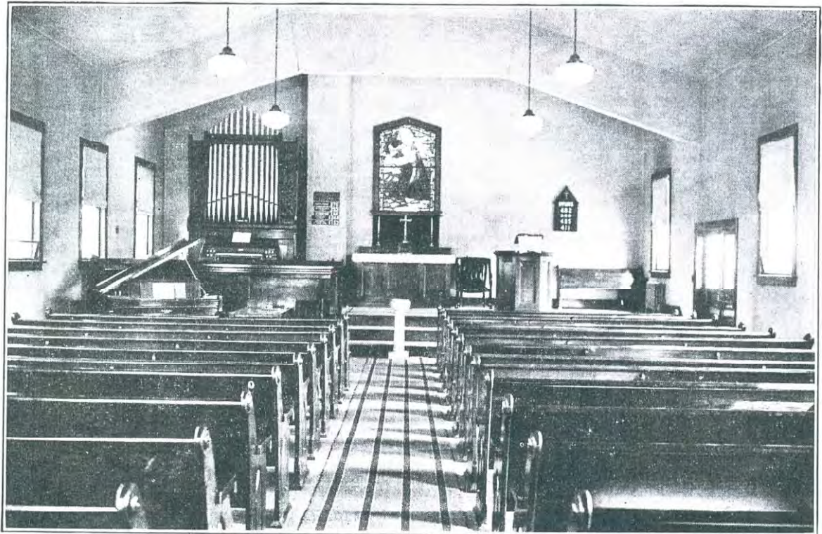
THIS HOUSE OF PRAYER — THIS HOME OF REST