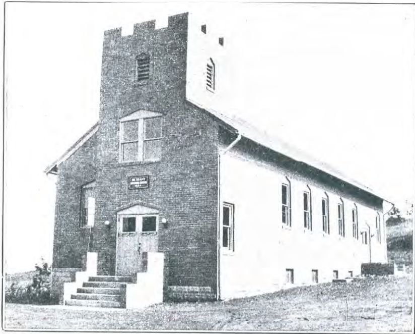
BETHANY LUTHERAN CHURCH "The Friendly Church"